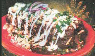
Burrito a la Mole

(Single homemade corn tortilla with your choice of meat topped with onions, cilantro and green tomatillo sauce garnished with lime) Carne asada, carnitas, al pastor, tinga or grill chicken. 5.50