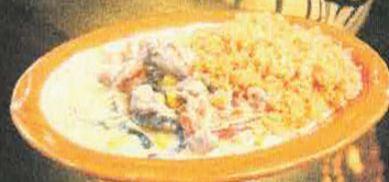
Pollo a la crema

Delicious cooked chicken breast, corn, sliced poblano chiles cooked in a special sour cream sauce with a touch of chipotle at your request (ask your server). 18.00