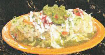
Customer Favorite (Green, Red or Chipotle sauce)