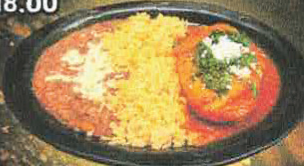
Tradicional Chile Relleno

Fresh roasted Pasilla pepper filled with Mexican cheese, served with rice and beans. 13.99